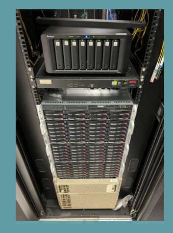
Computer nodes and flash storage servers maintained by Arnoldas Kurbanovas, UAlbany